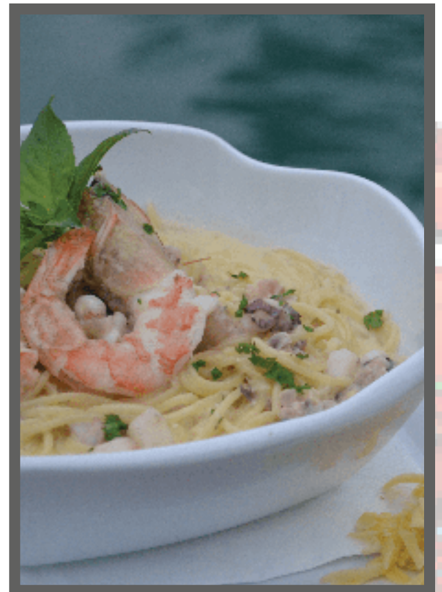
PASTA FRUTTI DI MARE