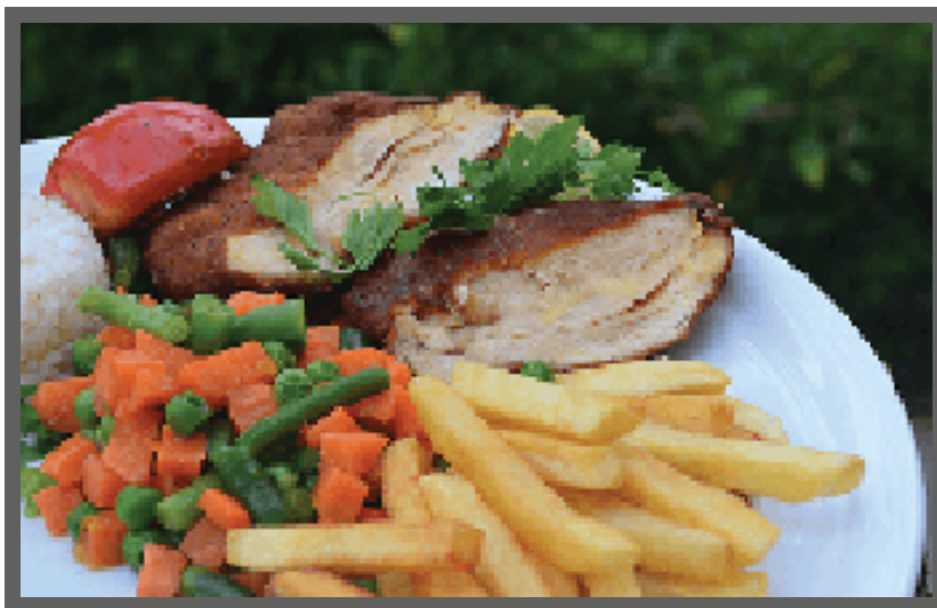
CHICKEN CORDON BLEU