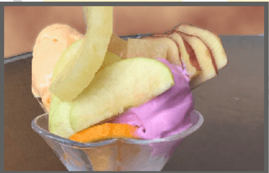
SELECTION OF ICED CREAMS