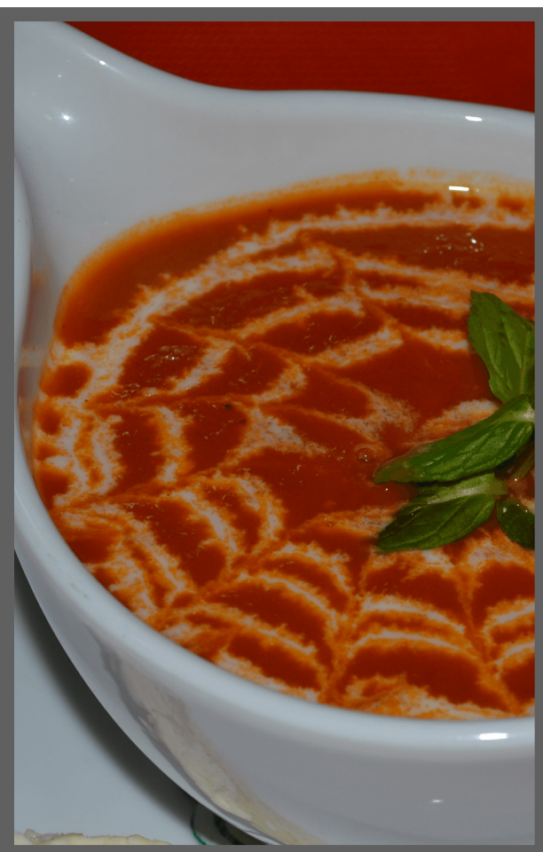
TOMATO & BASIL SOUP