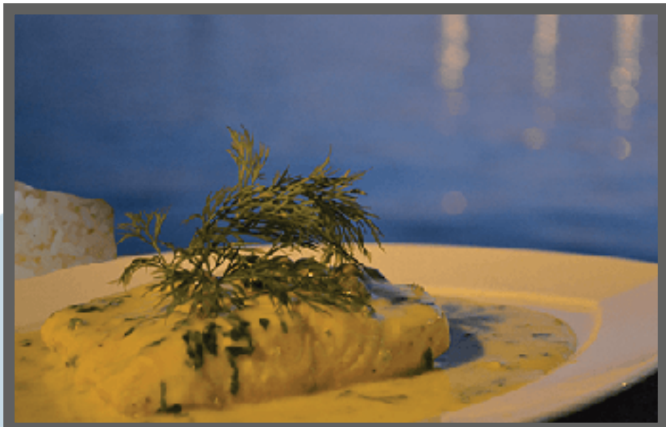
POACHED SALMON FILLET