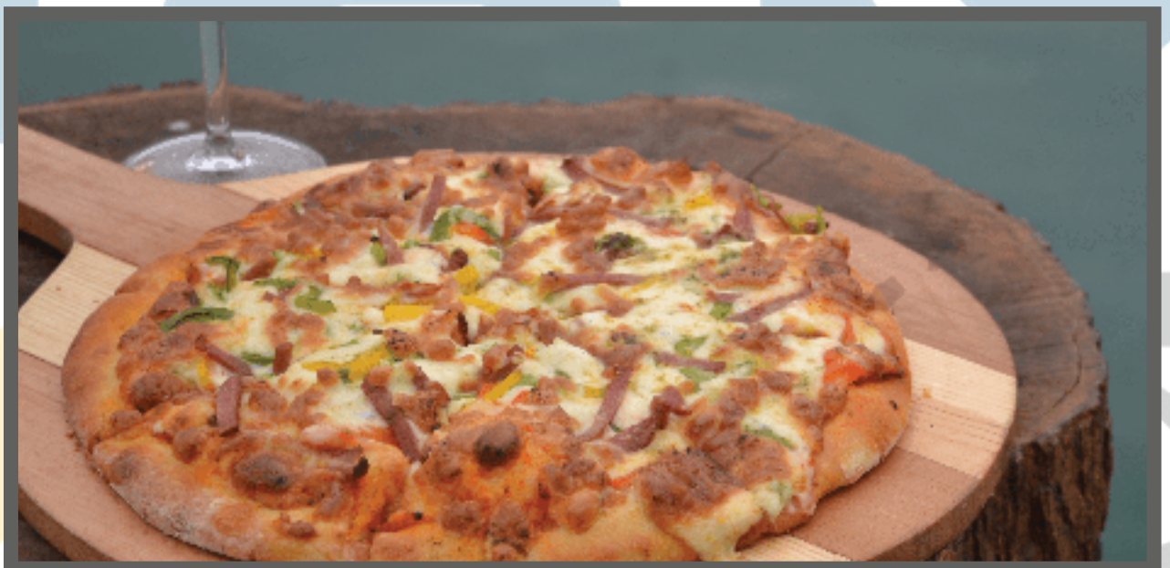
PIZZA LA RUSTICA