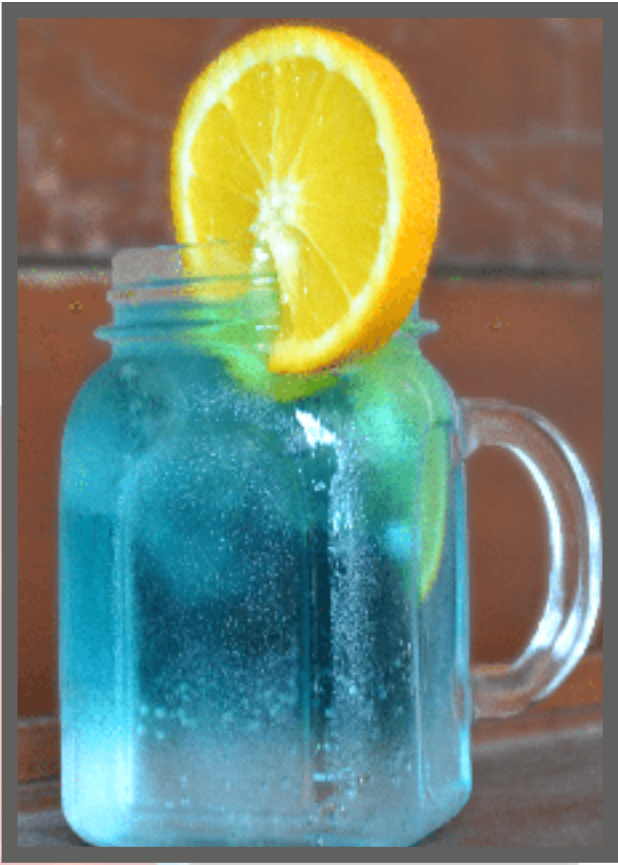
ELECTRIC ICED TEA