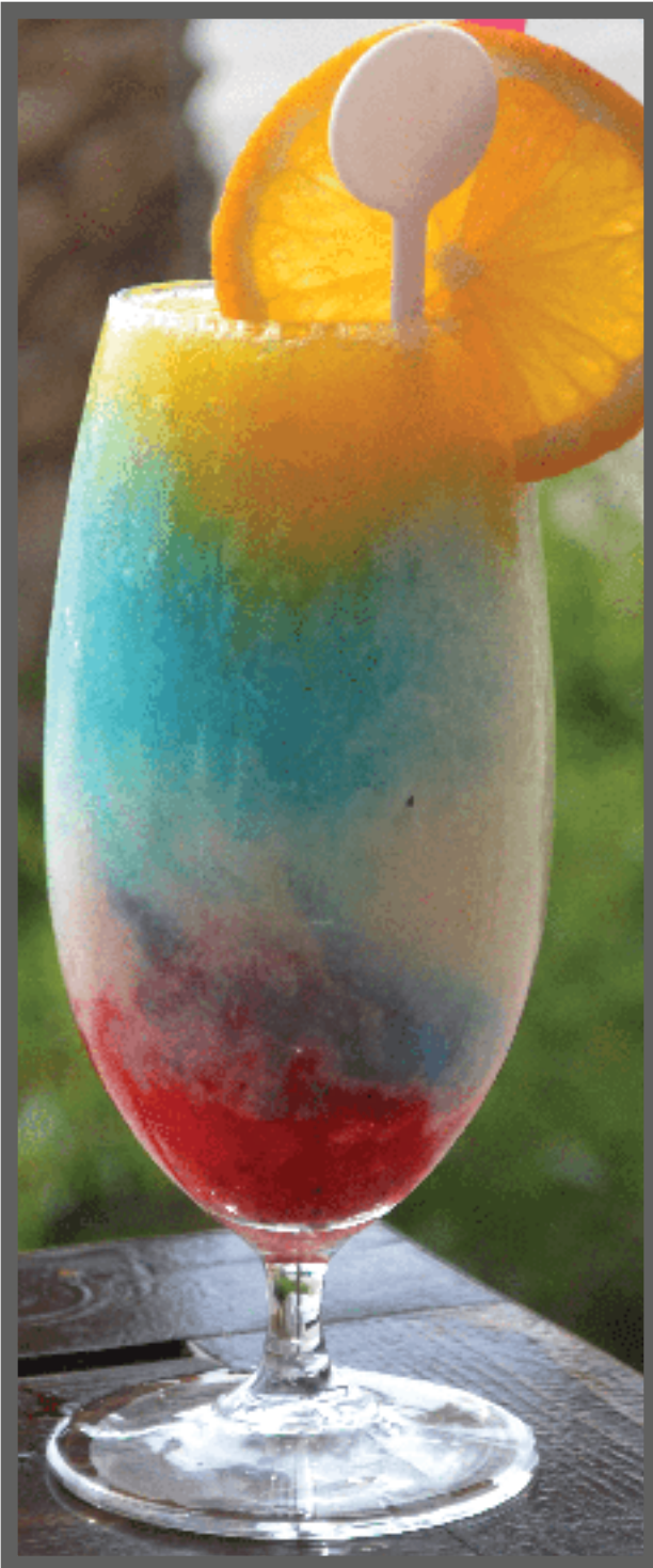
MIXED FRUIT SMOOTHIE