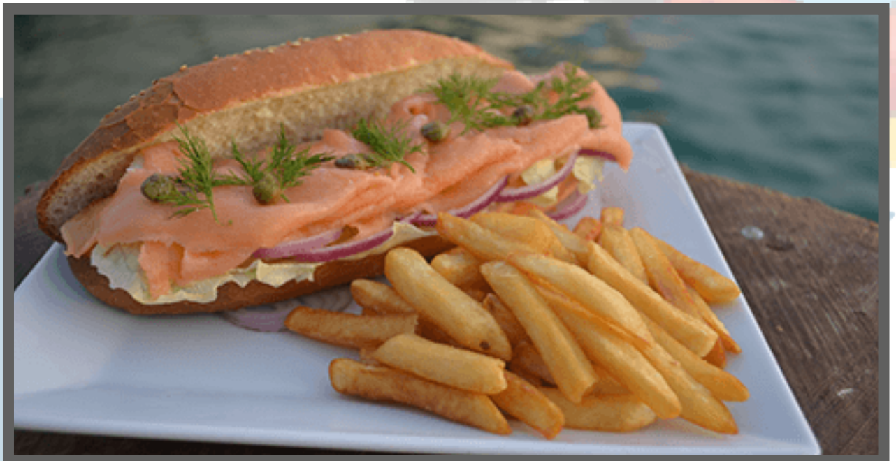
SMOKED SALMON SANDWICH