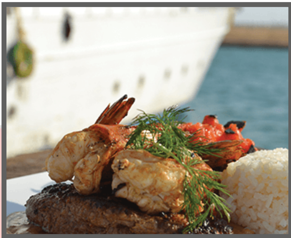
SURF AND TURF